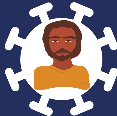
Feel weak one

If you feel any of these please call the clinic before coming to the clinic.