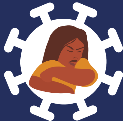
Dry cough or short wind