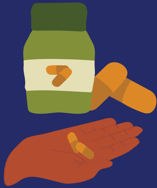
Take your medicines