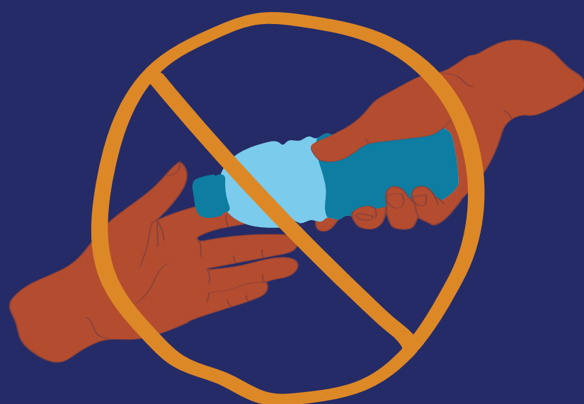
Do not share anything you put in your mouth